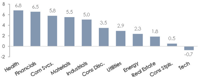
FIGURE 2 U.S. Sector Returns (January in %)

Data Reflects Most Recently Available As of 1/31/2025